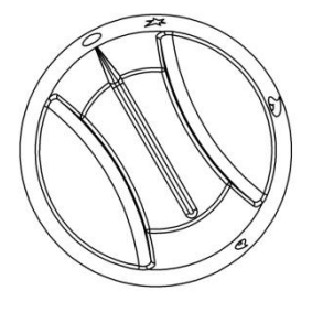
PILOT / Ignition